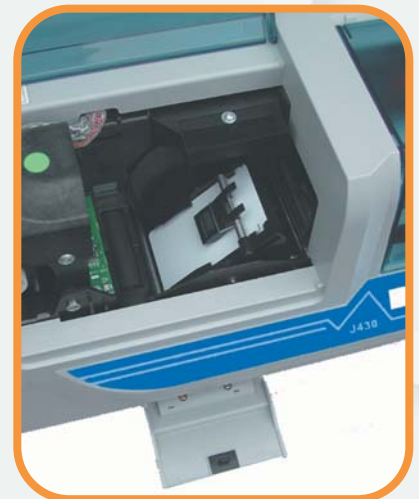
Integral flip-over unit for dual-sided printing